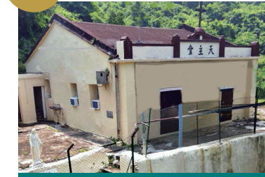
Our Lady of the Seven Sorrows Chapel built in 1900