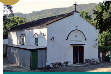
Immaculate Heart of Mary Chapel built in 1880