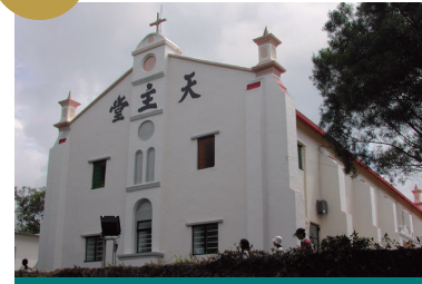
St. Joseph's Chapel built in 1890