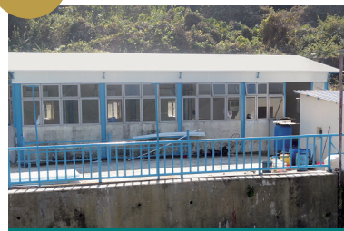
St. Peter's Chapel built in 1873