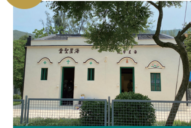
Star of the Sea Chapel built in 1953