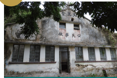
Epiphany of Our Lord Chapel built in 1879