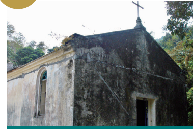
Holy Family Chapel built in 1867