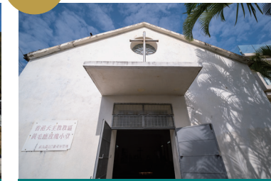
Rosary Chapel built in 1923