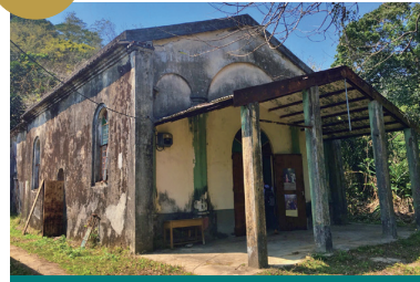
Immaculate Conception Chapel built in 1867