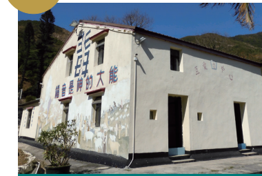
Nativity of Our Lady Chapel built in 1918