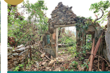
Lung Shuen Wan Chapel built in 1910