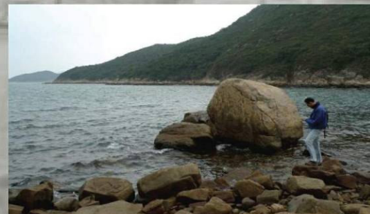
Kau Sai Chau — a large rock near Kau Sai Chau village that, according to local folklore, is the ligament of a scallop (pronounced 'Kau' in Cantonese) joining its two shells, the two represented by Kau Sai Chau and nearby Jin Island. It is the origin of the name Kau Sai Chau.

If you know of sites or have stories related to the Hong Kong's maritime and underwater cultural heritage, the HKUHG would be very keen to hear from you at hkuhgroup@gmail.com or call us at 9074 1785 .