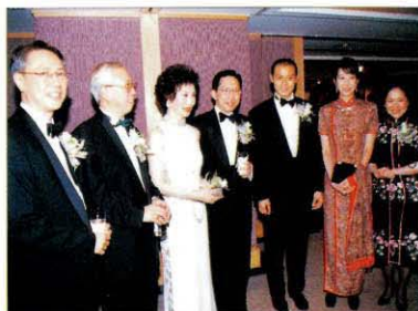
Group photograph of guests attending the Gala Evening.