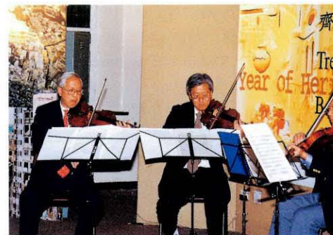
The final heritage concert of the Year of Heritage held at the Heritage Resource Centre.