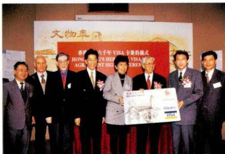
Group photograph of the officiating guests and the Antiquities Advisory Board Members at the Heritage VISA card agreement signing ceremony.

The Shanghai Commercial Bank Limited, in co-operation with the Lord Wilson Heritage Trust, issued the first Hong Kong's Heritage Credit Card to promote awareness of heritage preservation in Hong Kong following the successful implementation of the Year of Heritage Project in early 1998. The credit card, by adopting Hong Kong's splendid heritage as its theme, served to heighten the card users and the public's awareness of heritage. Under the agreement, the Shanghai Commercial Bank generously pledged to make donations to the Trust for subsidizing heritage-related activities. The credit card scheme was a good example of how commercial enterprises and heritage preservation bodies could work together to further heritage protection.