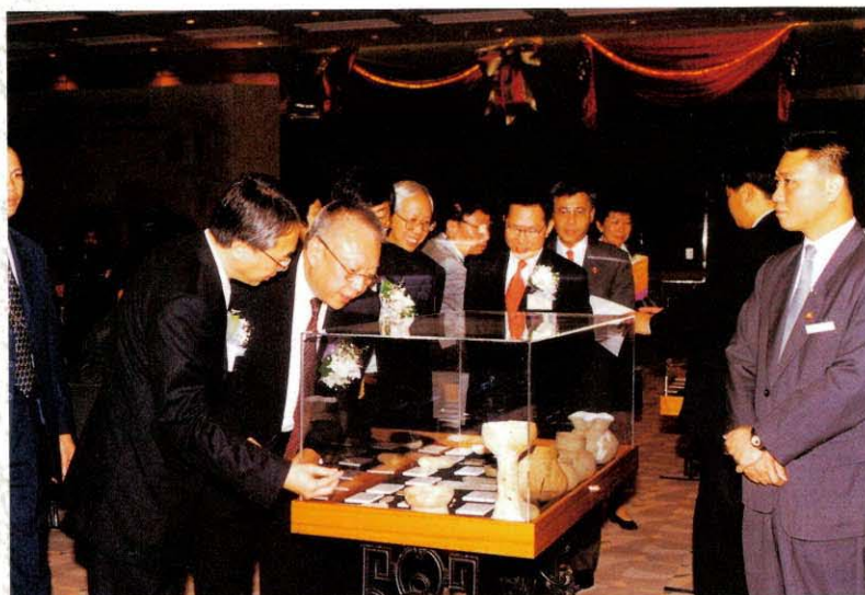
行政長官董建華正在參觀本港的考古文物 The Honourable Tung Chee Hwa, the Chief Executive, viewing the display of archaeological finds from Hong Kong.