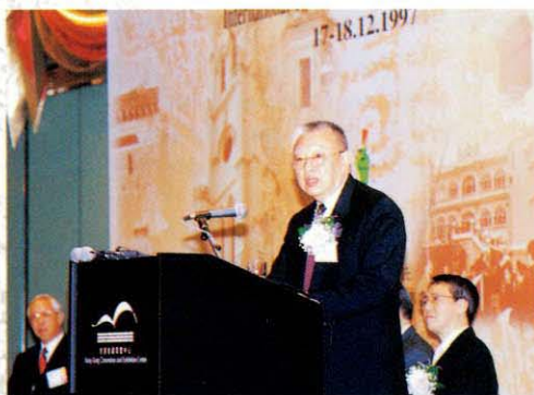
The Honourable Tung Chee Hwa, the Chief Executive addressing the gathering at the opening ceremony of the conference.

The finale highlight of the Year of Heritage was an international conference on heritage and education held on 17 and 18 December 1997 in the New Wing of the Hong Kong Convention and Exhibition Centre. Over 50 local, Mainland and overseas scholars and experts in heritage conservation and education attended, sharing their experiences and exchanging views with some 400