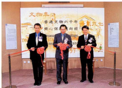
主禮嘉賓主持 「香港文物教育」展覽 的開幕典禮

這個展覽旨在介紹本港的考古及歷史文物所發揮的教育作用。此外，該展覽亦介紹在學校舉行的文物活動。