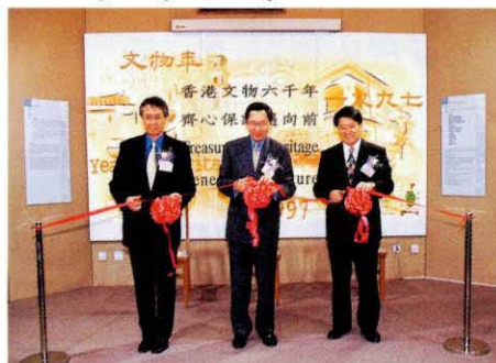
The officiating guests conducting the opening ceremony of the "Heritage Education of Hong Kong" exhibition.

The exhibition presented the educational function of archaeological and historical monuments in Hong Kong. Heritage-related activities in schools were also presented.