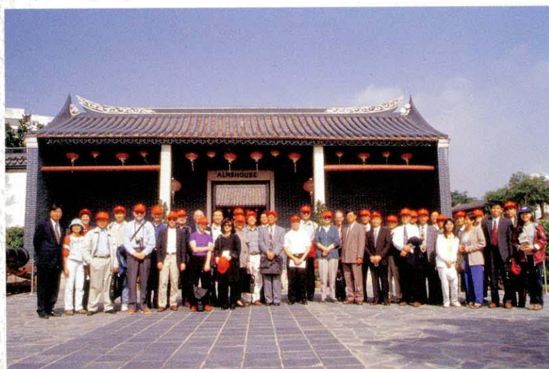
研討會代表團參觀九龍寨城衙門 The conference delegates were guided to tour The Yamen building of the Old Kowloon Walled City.