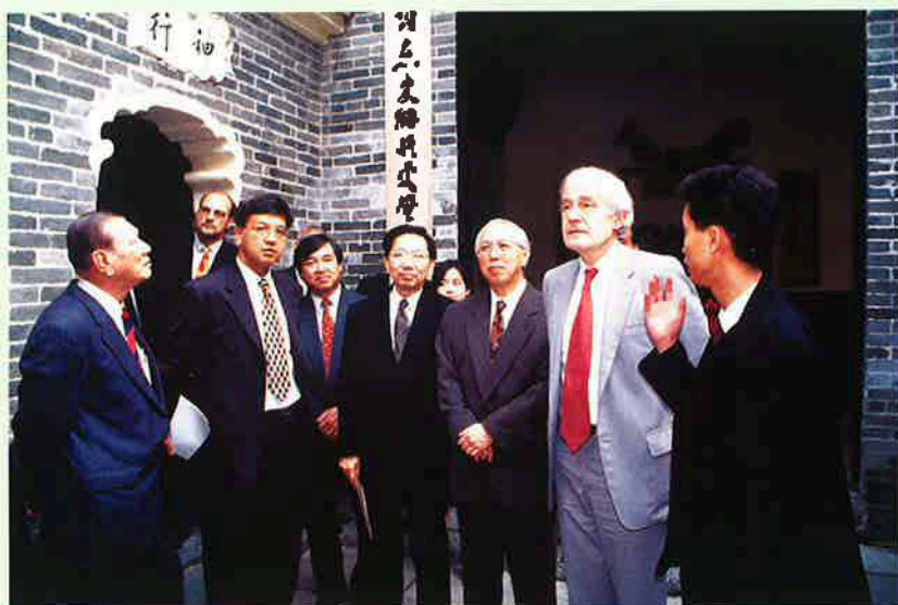
1. Members of the Board of Trustees and the Council accompanied Lord Wilson to visit Kam Tin in the New Territories. 受託人委員會及理事會成員陪同衛奕信勳爵訪問新界錦田。