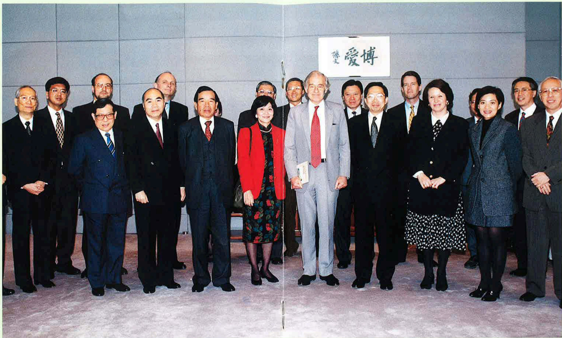
3. A group photograph of members of the Board of Trustees and the Council with Lord Wilson, taken when he visited Hong Kong in January 1996. 簡奕信勳爵在一九九六年一月訪問香港時，與受託人委員會及理事會成員拍照留念。