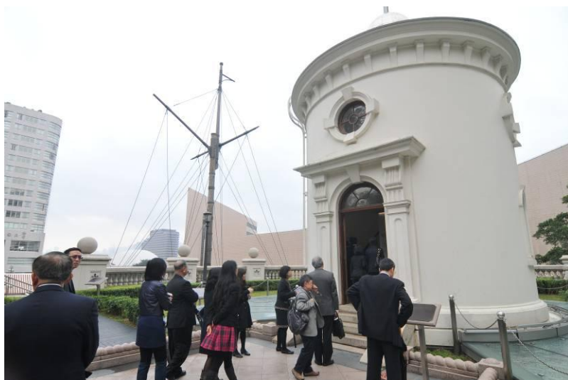
Members visited the time ball tower at 1881 Heritage