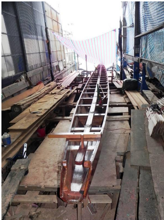
A newly built traditional dragon boat

The building of all dragon boats and deity boats was completed in early 2012. Members of the Board of Trustees and Council of the Trust attended the sanctification ceremony held on 6 May 2012. The boats were later used for the annual traditional dragon boat parade in Tai O in 22-23 June 2012 and would continue to serve the same purpose in future.