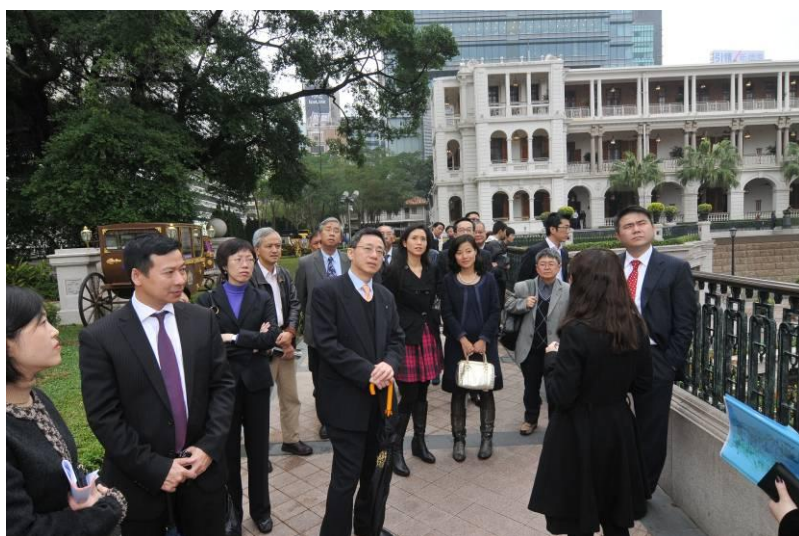
Docent introduction of the historical background of the heritage buildings

Members went on to visit the “Explore Our Heritage” Permanent Exhibition at the Hong Kong Heritage Discovery Centre. They enjoyed the docent tour arranged by the Antiquities and Monuments Office and were well informed of the Hong Kong’s rich cultural heritage from the perspectives of archaeology and architecture.