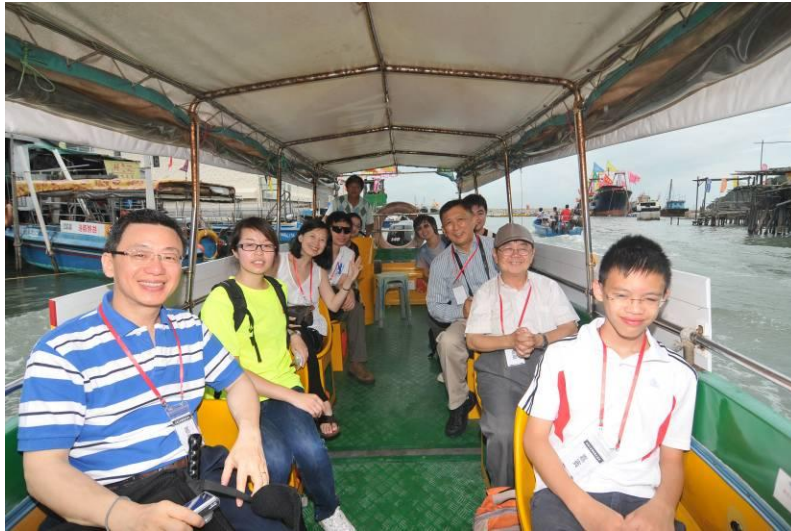
Members of the Board of Trustees and Council of the Trust at the Tai O dragon boat parade on a boat