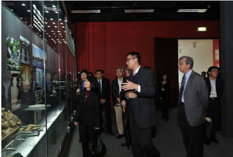
Curator of the Hong Kong Heritage Discovery Centre introduced the artefacts on display at the “Explore Our Heritage” Permanent Exhibition