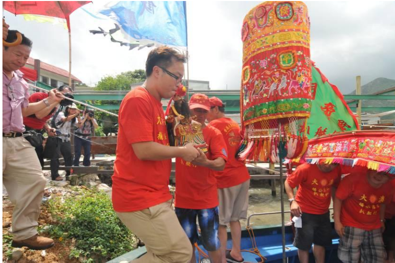
Performance of the deity invitation ritual before the dragon boat parade