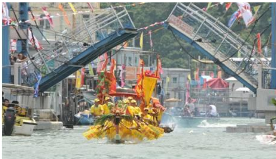
The Tai O dragon boat parade was held on 23 June 2012