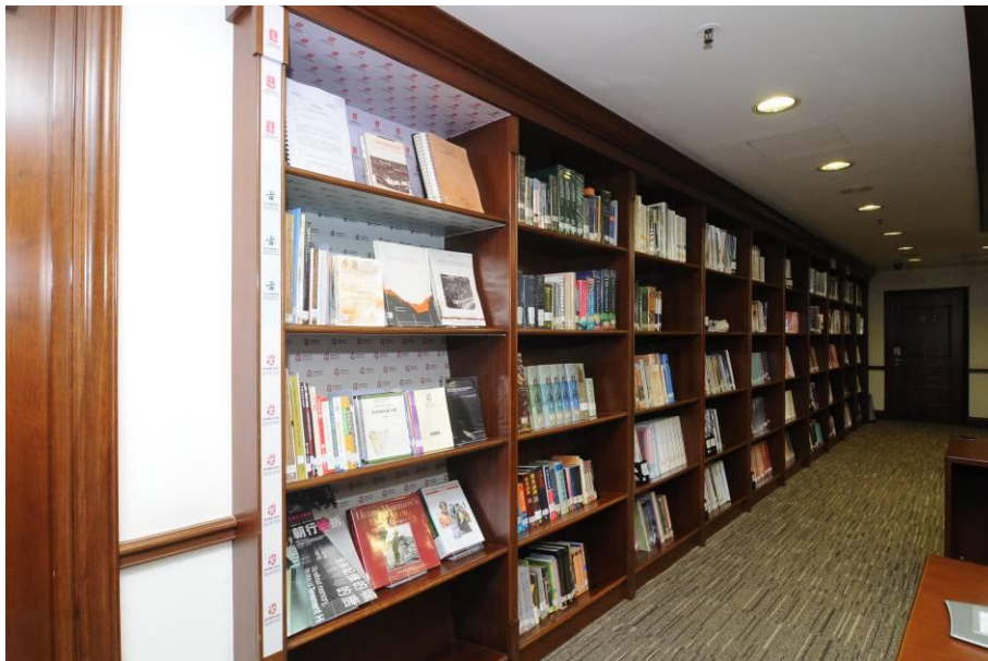
A corner inside the Reference Library of the Hong Kong Heritage Discovery Centre was dedicated to Lord Wilson Heritage Trust for placing the Trust’s publications